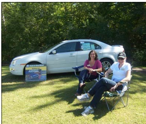
President and Past-President Pow-Wow